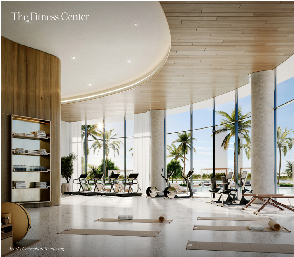
The Fitness Center