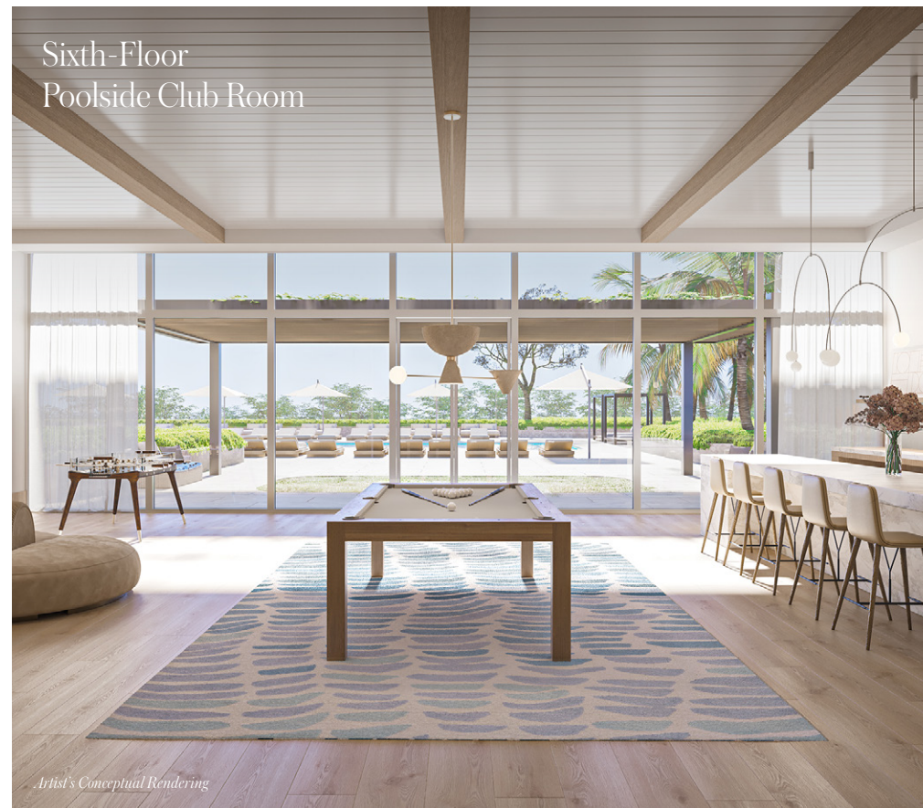
Sixth-Floor Poolside Club Room