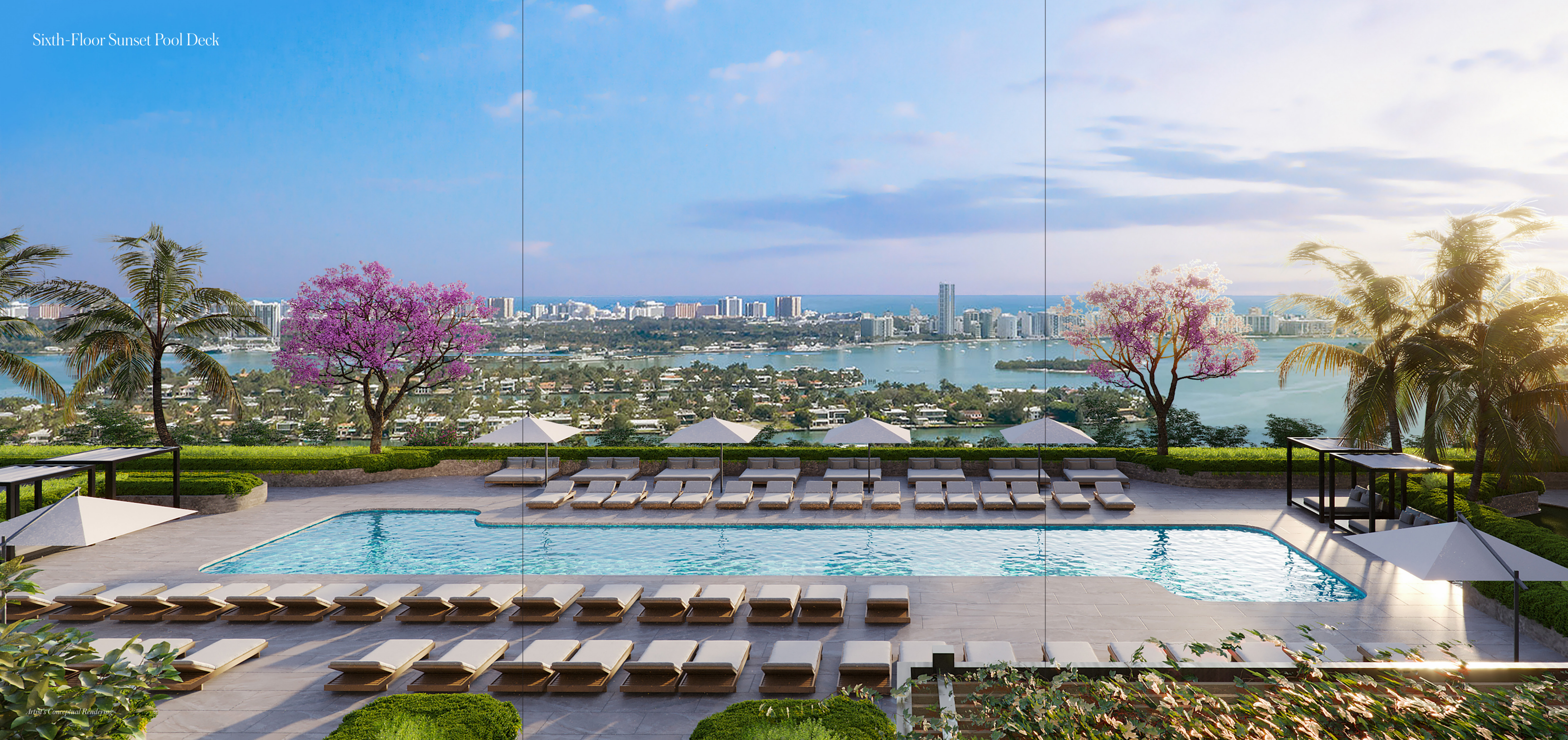
Sixth-Floor Sunset Pool Deck